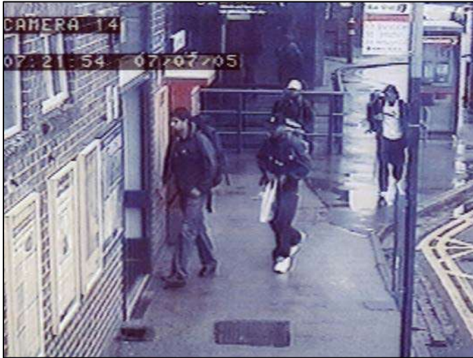
London 7/7 bombers Mohammed Siddique Khan and Shehzad Tanweer approach the station with third bomber Germaine Lindsay.

plan to build a Tablighi Jama'at mega-mosque next to Olympic Stadium, should the UK win its bid for the Olympic Games. 123 He believed the bombing was intended to disqualify Britain from winning the bid.