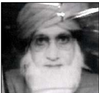
Maulana Muhammad Ilyas al-Kandhlawi