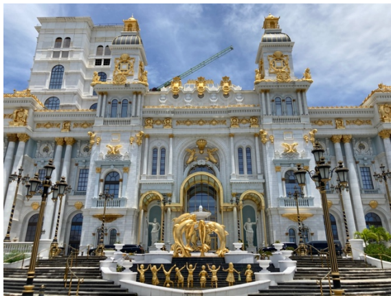
Figure 1: Now closed PRC-linked casino in Saipan.

They also established political and economic influence and an exclusive licence was granted to a Chinese casino operator that was, explained the Governor, “mired in litigation and criminal investigation practically from the start... The Chinese casino on Saipan at its peak raked in billions of U.S. dollars in monthly rolling chip volumes from just 16 VIP tables, outdoing even the glitziest casinos in Macau.”